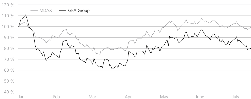
Performance of GEA Group's share price against the MDAX

GEA Group's shares closed at EUR 10.79 on June 30. Based on this closing price and the total number of shares (183,807,845), GEA Group's market capitalization was approximately EUR 2.0 billion at the end of the second quarter. Deutsche Börse AG only calculates the Company's market capitalization on the basis of its free float (84 percent) and therefore arrived at a figure of EUR 1.7 billion. The Company held no treasury shares as of June 30, 2009.